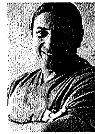
Jorge Campos Learn More